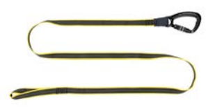
80 lbs or less