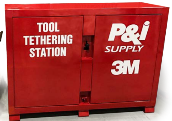
JOBMASTER KNAACK MODEL 129