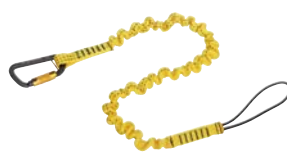
10 lbs or less