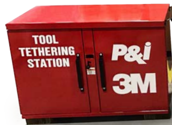
STORAGEMASTER KNAACK MODEL 49

This innovative tethering station set will provide the site with a one stop shop for tethering tools. An employee, expertly trained in tool tethering by a P&I expert, will man the station and tether tools for anyone on site. Simply keep the station stocked with the appropriate product and lock it up when not in use.