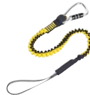
35 lbs or less